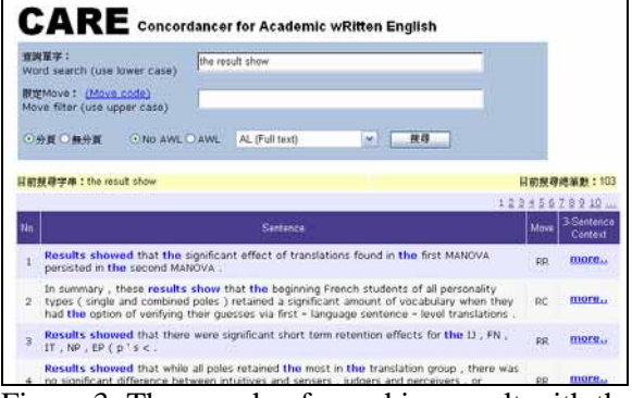
Figure 3: The sample of searching result with the phrase "the result show"

Once a query is submitted, CARE displays the results in returned Web pages. Each result consists of a sentence with its move annotation. The words matching the query are highlighted.